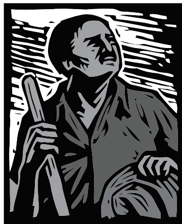
Which is the greatest commandment?