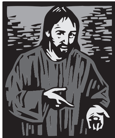
Give back to Caesar what belongs to Caesar