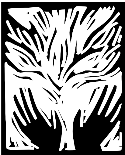
The Holy Spirit will remind you of all I have said to you

The Spirit is the Spirit of Christ; the Spirit is the very life principle of the Church; the Spirit dwells in each believer as our 'paraclete' – the companion who stands by us in all our trials, providing whatever is needed to survive every trial. We live 'in Christ' because he has given us his own Spirit. Writing to the Romans, St. Paul reminds these new converts that, together with the Father and the Son, the Holy Spirit will come to 'live in them' – renewing their lives, as they set aside their old fears, and find joy and encouragement, as the Father's beloved 'children' who are 'coheirs with Christ', sharing the blessings of his resurrection.