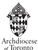
Archdiocese of Toronto

Lectio Divina ("divine, or sacred, reading") is the name given to a spiritual tradition among Christians over the last two thousand years. This form of prayer involves three distinct stages: a) reading a short scripture passage b) reflecting on the passage and c) a short period of silence. We begin with Vespers at 7pm, followed by Lectio Divina from 7:30—8:15pm. All are welcome to join in this special evening of prayer. During the extensive renovations at St. Michael's Cathedral, Lectio Divina will be traveling to parishes around the archdiocese. Visit www.archtoronto.org/lectio