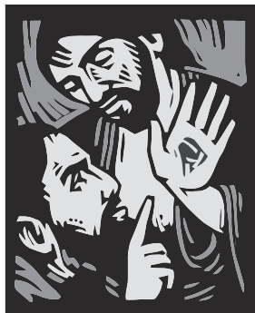
A celebration of Easter faith

This gospel invites us to share the experience of the disciples, finding faith through the coming of the Lord into their midst on the evening of his Resurrection Day. What a dramatic situation – they are to meet the one whom they have deserted and abandoned to his fate. There is no word of reproach, no reference to what has taken place, only 'Peace be with you' and again 'Peace be with you' – you are forgiven, come once more into my friendship. Their finding faith is a meeting with God's generous and reconciling love. And he sends them forth with the good news of the forgiveness of sins.