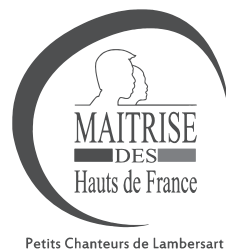
Petits Chanteurs de Lambersart