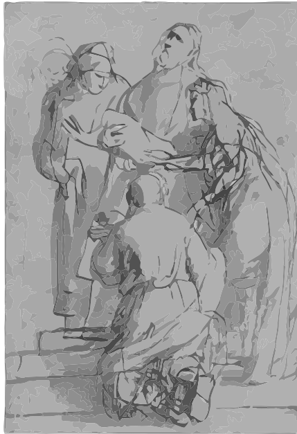
The Lord you are seeking will suddenly enter his temple

The gospel reading from Luke's Infancy Narrative is a masterpiece, an apparently simple account that weaves together several themes that are fundamental to the gospel story he is about to tell. What a contrast between the prophet Malachi's description of the Lord coming to his temple and the scene sketched by Luke – in which all the characters are from the anawim, the poor and humble ones of God's people to whom first and foremost the messianic blessings were promised. Luke underlines the fact that the Holy Family made the presentation in fulfilment of the Law of Moses. Until his "hour" had come, Jesus himself was a faithful observer of the Law, the God-given prelude and foreshadowing to which he would bring fulfilment. He was truly one with us in the life we lead, as the reading from Hebrews reminds us: "because he has himself been through temptation he is able to help those who are tempted". Luke includes a moving detail, pointing to the fact that Joseph and Mary were not well off. The offering prescribed, in Leviticus 12, was a lamb; the pair of birds was the offering of those who could not afford the lamb.